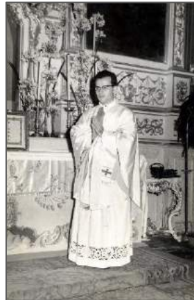
1965 - 27 years old... on my First Mass Day

Now I am 85 years old. If I could go back in life, I would choose to follow the same road. I never thought that it would be so difficult